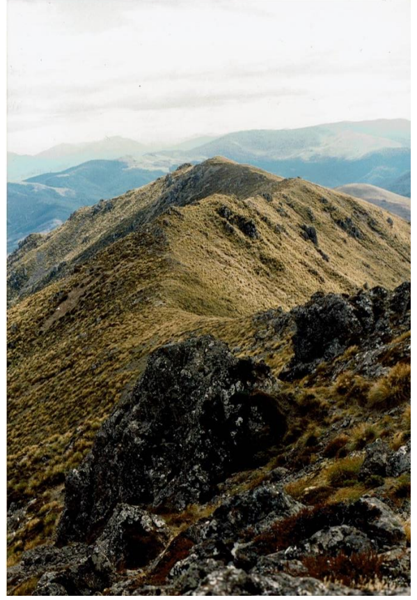
Looking West from top of West Dome