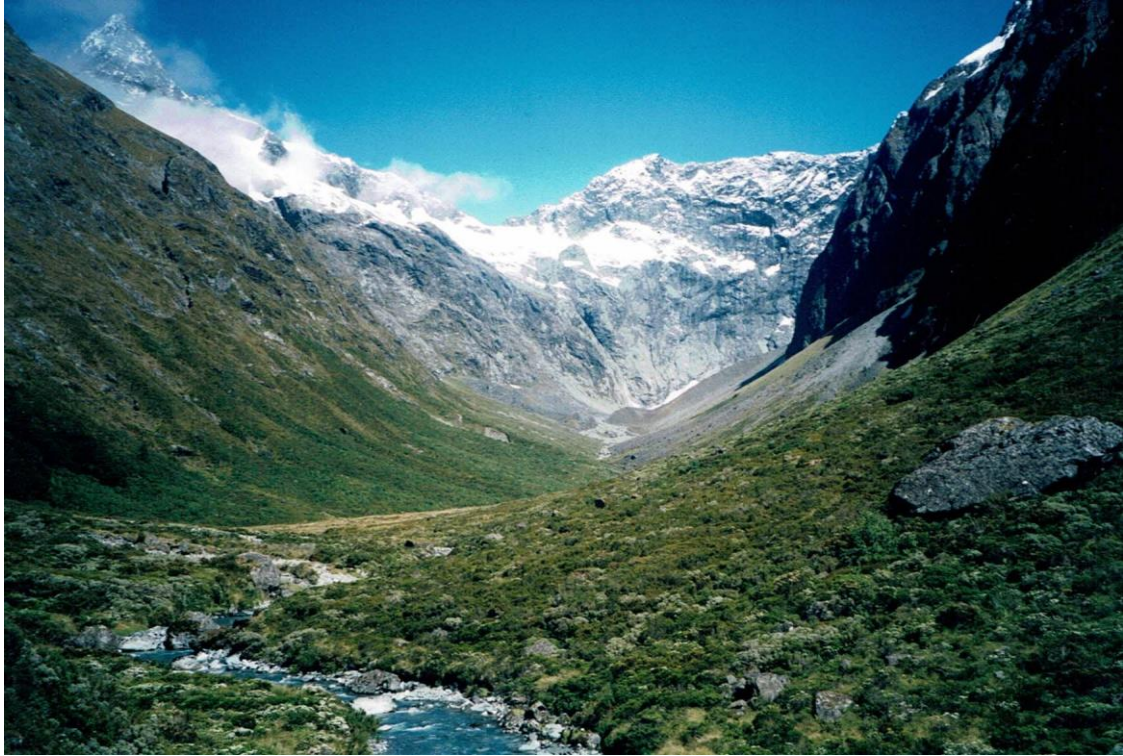
Falls Creek Fiordland