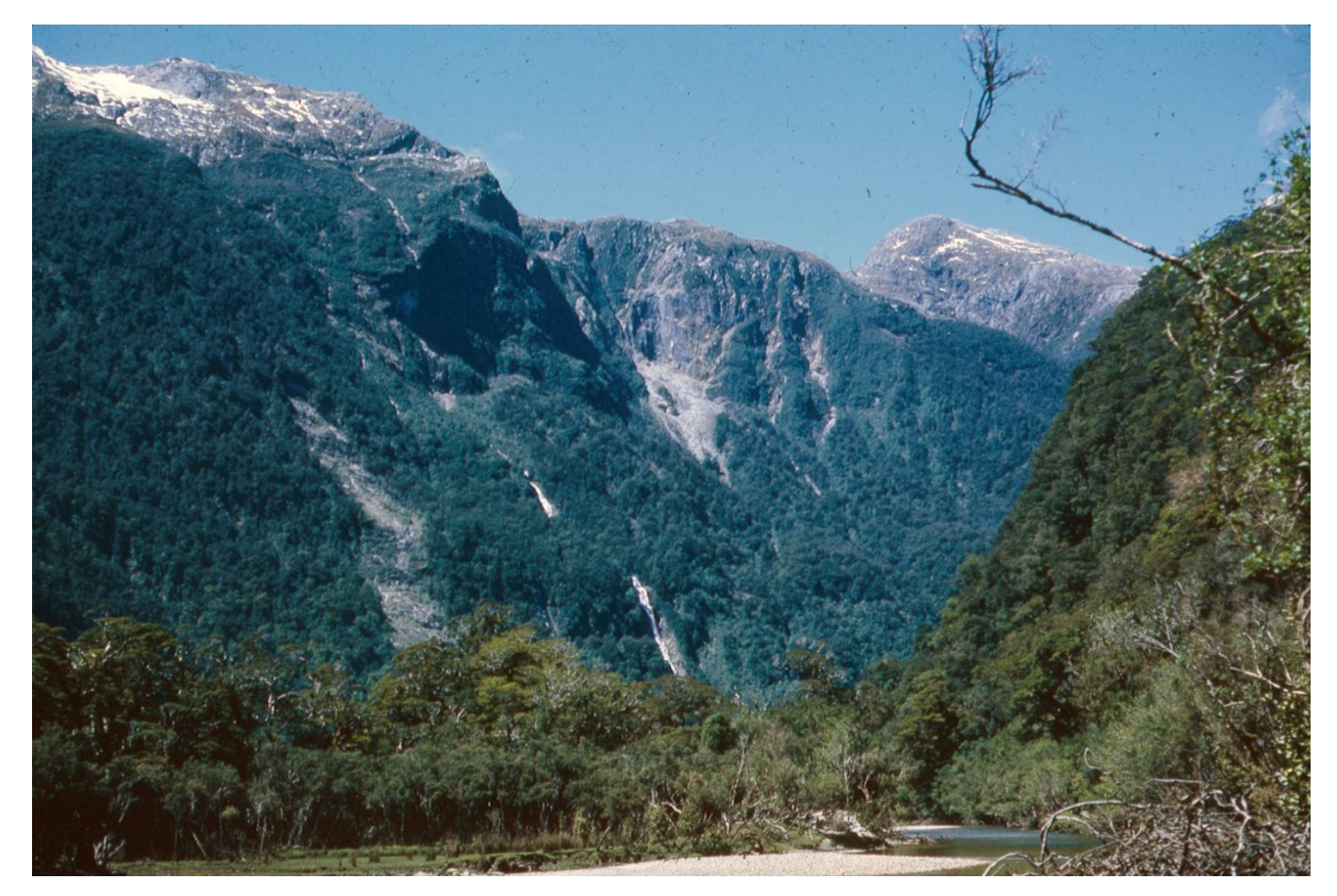
Looking up the Worsley from the mouth of Terminus Creek.

On past Terminus and Prospect creek, coming in from our right and then crossing to our left up over the Worsley falls, to enter the upper portion of the watershed and the Bog Clearing.