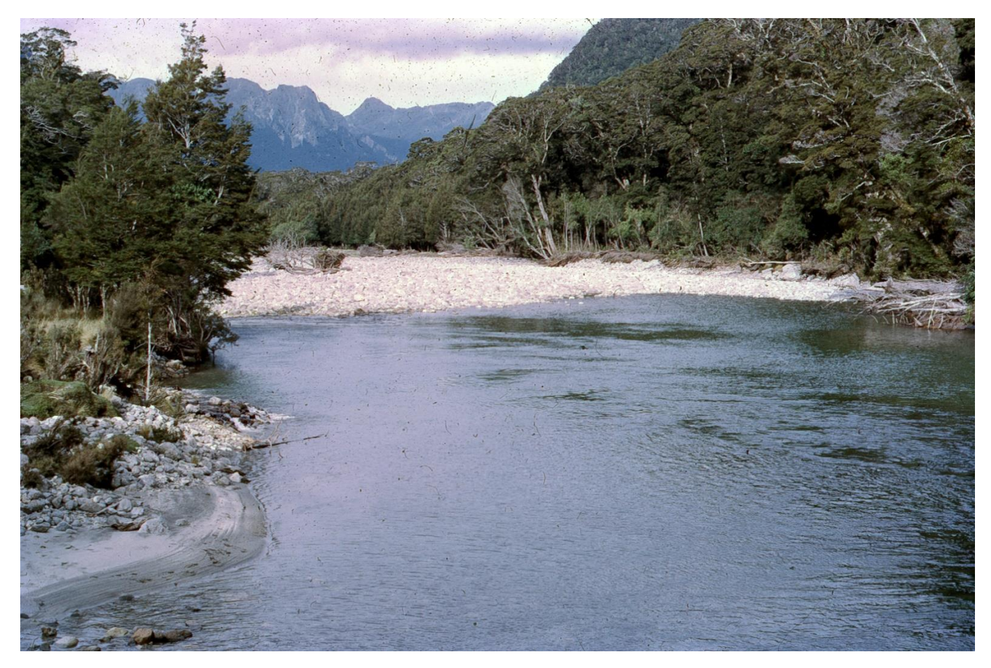
Confluence of the Worsley and Castle rivers looking down stream.

Next stop was the confluence of Terminus creek, there is a nice open area and flat there, with a good patch of "Green" across from the mouth running up the side of the valley.