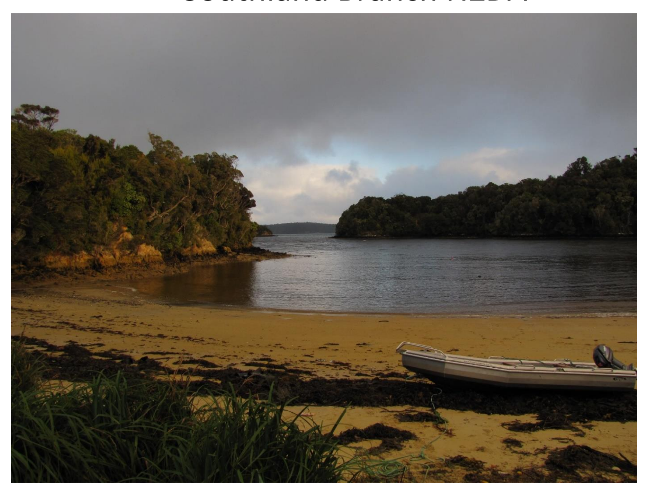
North Arm Port Adventure