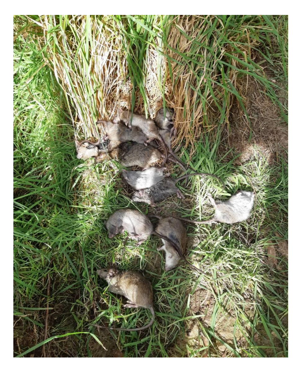
Some of the collection from the Hut

It will be interesting to see how the next five parties go. Thus it is likely this year that our efforts will make a significant if localised difference.