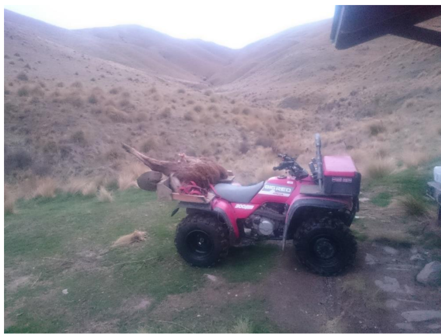
Old big red doing the business