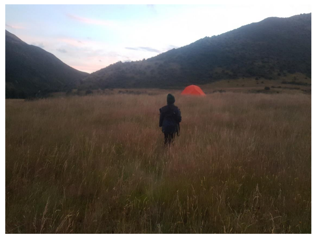
Getting the kids out amongst it