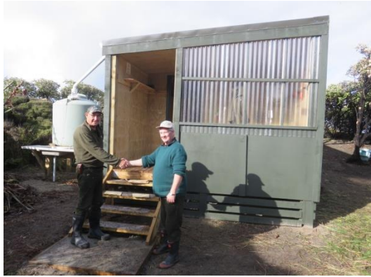
The New Hut