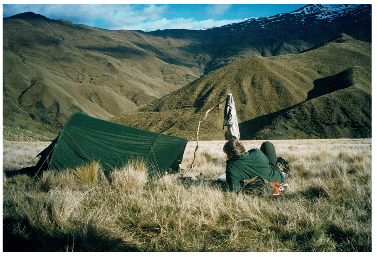
Alec Butters Deep Ck