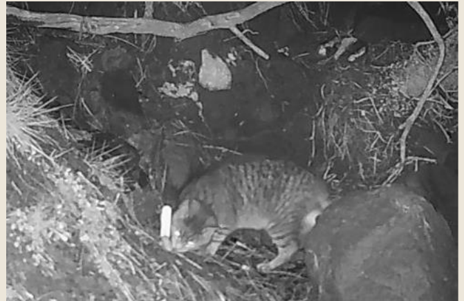
Figure 1. Feral cat consumes meat bait during trial on Rakiura, winter 2023