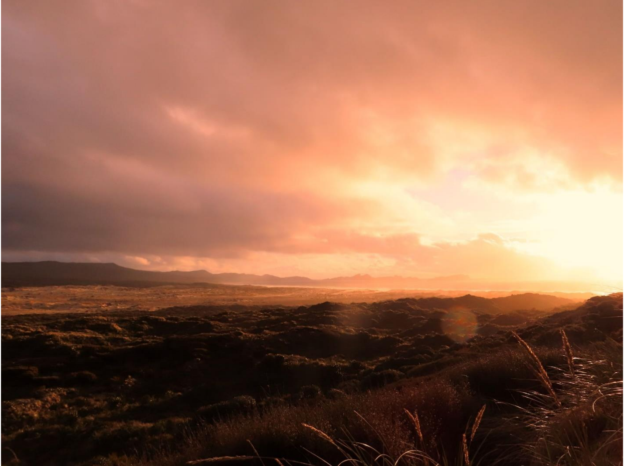
Mason Bay Sunset