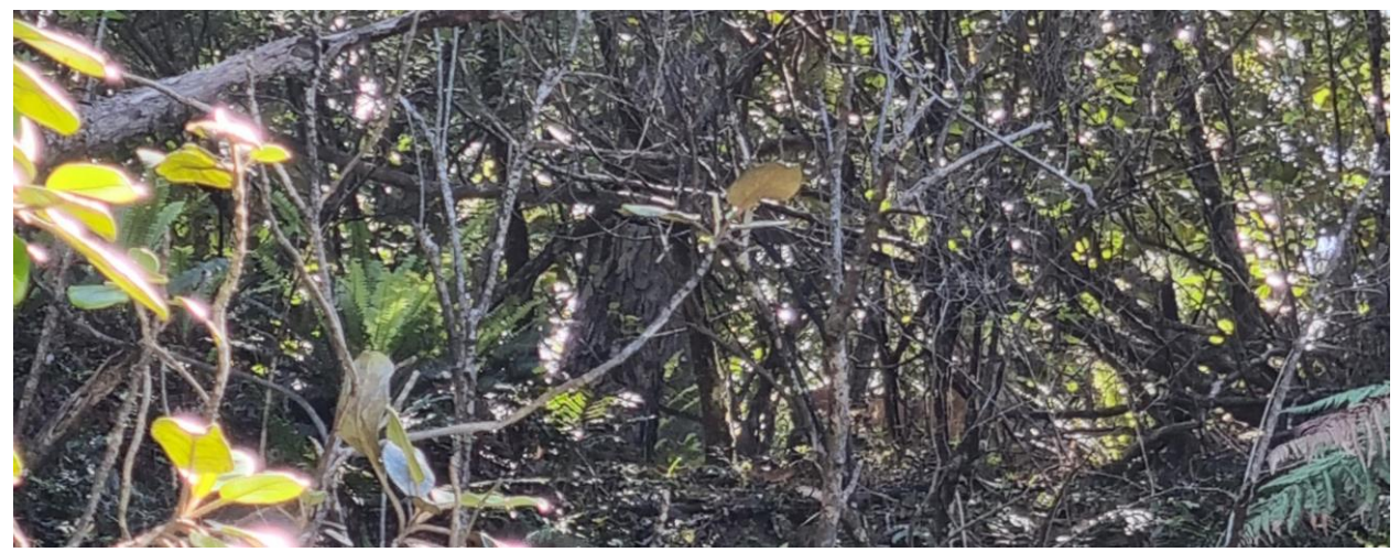
Spot the deer

We've got a bit planned for the club this year, we will be running the Hunts course again so if you are keen please get in touch and we can get you on the list we have limited spots available to run the course effectively and offer as much one on one as we can we can only take up to 10.