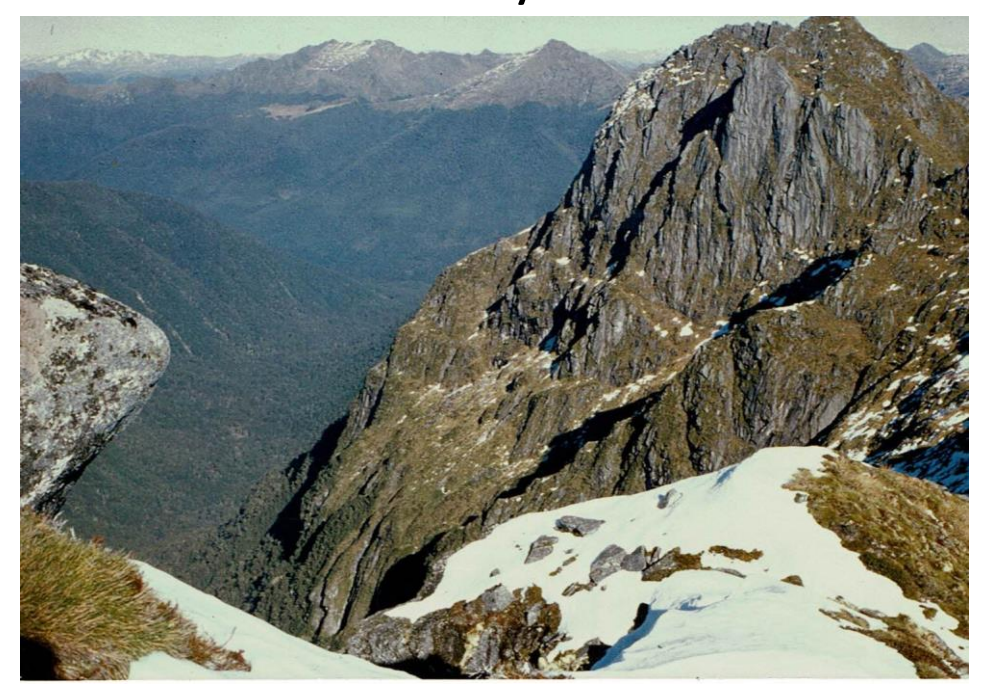
Lake Stream Victoria Range North Westland