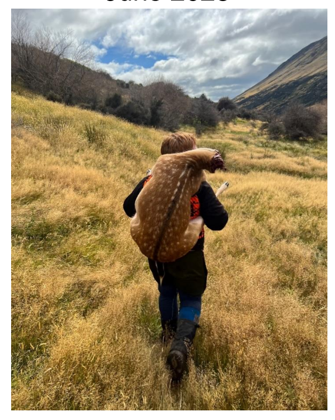
Frist Place Topical Luke Payne